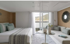
Grand Deluxe Suite