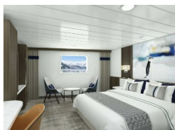
Balcony Stateroom Category A