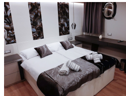
Below Deck Cabin