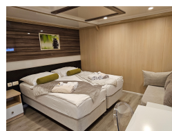
Upper deck VIP