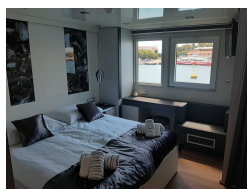
Upper Deck Cabin with Balcony VIP upper deck cabin

The Small Cruise Ship Collection www.small-cruise-ships.com