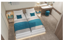
Lower Deck cabin