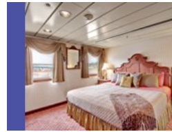
Jr Commodore Suite