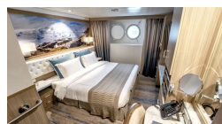
Balcony Stateroom - A