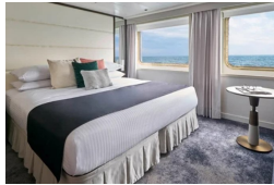
Category 01. From