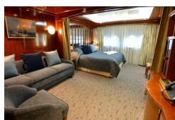
Byrd Deck Superior Sole