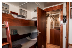
Twin Cabin Solo