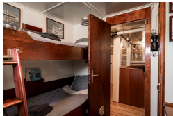
Twin Cabin Solo