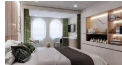
Oceanview D4 for single occupancy