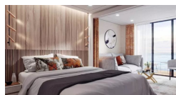
Oceanview D4 for single occupancy