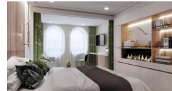
Oceanview D4 for single occupancy