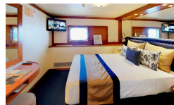
Orchid Cabins - Twin Share