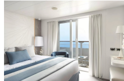
Grand Privilege Suite