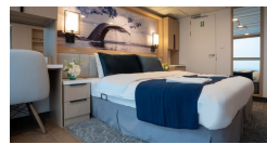
Grand Balcony Stateroom