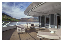
Grand Deluxe Suite