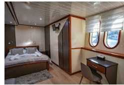
Upper deck cabin