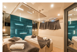
Upper Deck Cabin with Balcony