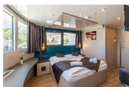
Upper Deck Cabin with Balcony