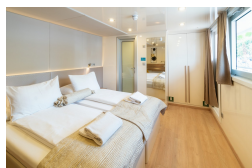
Upper Deck Cabin with Balcony