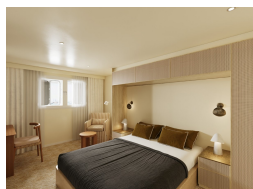
Ocean Twin Stateroom