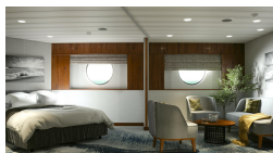
Arctic Superior. From