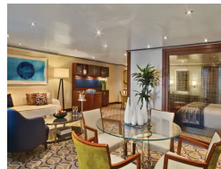
Panorama Penthouse Suite - From