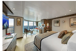
Veranda Suite - From