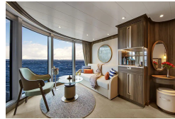
Penthouse Suite - From