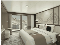
Grand Veranda Suite