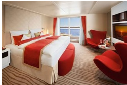
Suite with panorama window