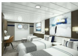
Aurora Stateroom Twin