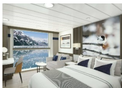
Aurora Stateroom Superior Single