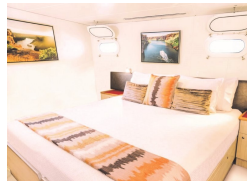
Ocean/River Premium Cabin