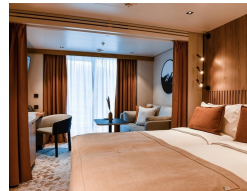
Junior Suite - from