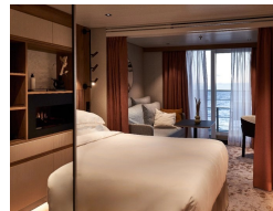
Balcony D6 - from