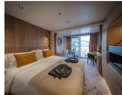
Balcony M5 - from