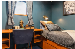
Signature Twin - Cabins 1-2 & 4-5