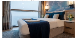
CATEGORY F, PORTHOLE TRIPLE STATEROOM 4 Cabins, Size 20 sqm/215 sqft