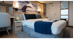
Grand Balcony Stateroom