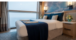
French Balcony Stateroom