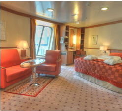
Polar Inside. From Polar Outside. From