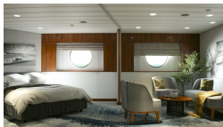
Arctic Superior. From