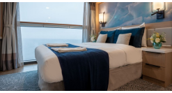
French Balcony Stateroom