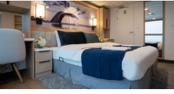
Grand Balcony Stateroom