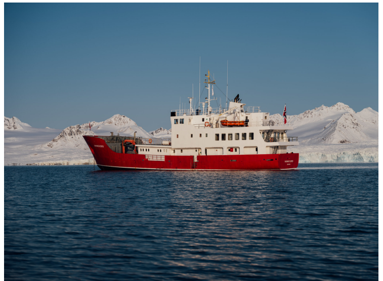
Accessible bow deck.

MV Vikingfjord is an ice-strengthened expedition vessel for 12 guests with great environmental credentials. MV Vikingfjord entered service in Svalbard for low impact expeditions in May 2023. She offers cruise ship comfort on a small ship with 9 ensuite cabins, an open plan saloon with rear facing windows, and on on deck hot tub and sauna. What we love about Vikingfjord · One of the most environmentally friendly small ships in the polar regions with a 95% reduction in NOX emissions. · Large, open plan saloon and comfortable lounge located at the stern with sofas and large rear facing windows to enjoy the view. · 9 Spacious cabins with modern decor, comfortable beds and ensuite bathrooms with a choice between doubles, twins or singles. · Enjoy a sauna or outdoor hot tub on the upper deck. · Lounge area on the bridge with a great view. · Ice strengthened hull with 1B rating for exploring the polar regions. MV Vikingfjord Key Features: · New energy efficient engine and NOX cleaning fitted in 2022 offering the best environmental credentials. · Rebuilt from the ground up in 2022 as a modern expedition vessel offering cruise ship comfort. · Accommodates 12 guests in 9 ensuite cabins with windows that are all situated above the waterline. · Modern interior finished to a high standard in 2023. ·