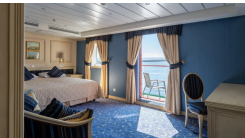
Junior Suite - From.