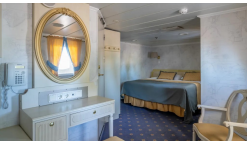
Owner's suites with private walkway - From.