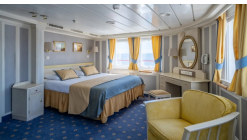
Standard Double/Twin Cabin - From.