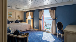
Junior Suite - From.