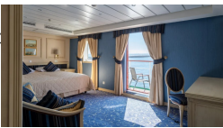
Executive Suites with Balcony