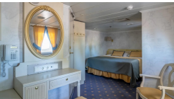
Owner's suites with Private Walkway - From.