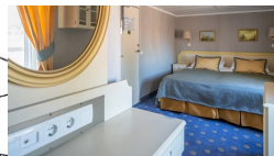
Executive Suites with Balcony - From.