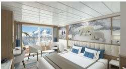
Balcony Stateroom Category B