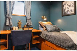
Signature Twin - Cabins 1-2 & 4-5