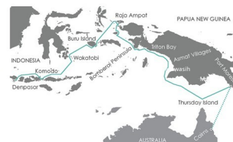
Cruise Expedition Map (Denpasar to Port Moresby, then fly to Cairns)