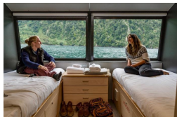
Governor Suite Executive King