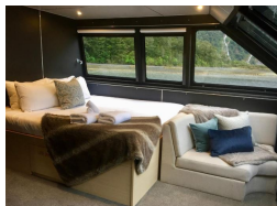
Resolution Deluxe Quadruple