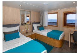
Below Deck Cabin