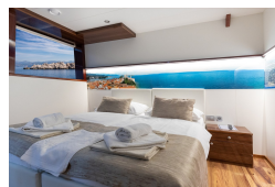
Main Deck Cabin - Twin Cabins