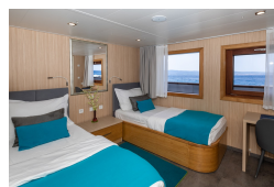
Upper Deck Cabin