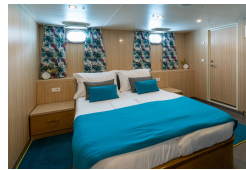
Below Deck Cabin Single Lower Deck Cabin