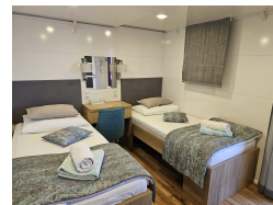
Main deck cabin