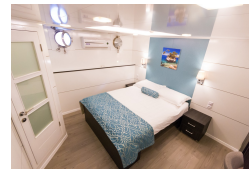
Lower deck cabin