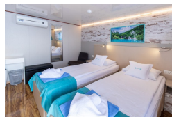
Lower Deck Single Cabin