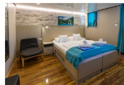
Main Deck Cabin Single