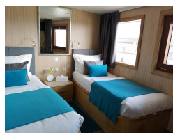
Main Deck Cabin Single