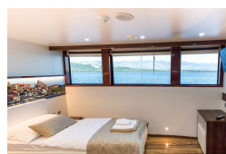
Main deck cabin for single occupancy