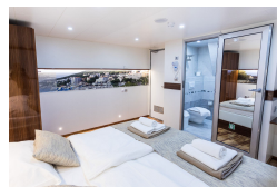
Lower deck cabins