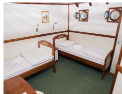
Lower Deck - SOLD OUT