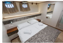
Below Deck Cabin