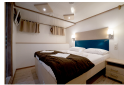
Main Deck - SOLD OUT