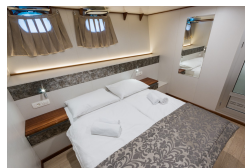
Below Deck Cabin