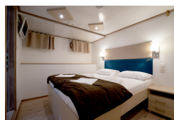
Main Deck - SOLD OUT