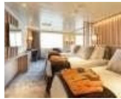
Owner's Suite Solo Panorama