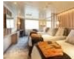
Deluxe Balcony Suite