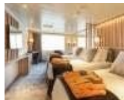
Deluxe Balcony Suite