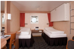
Cat 3 - Twin