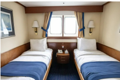
Owners Suite Superior