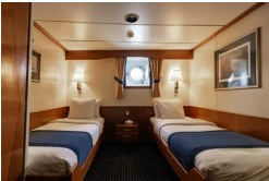
Main Deck Twin Window