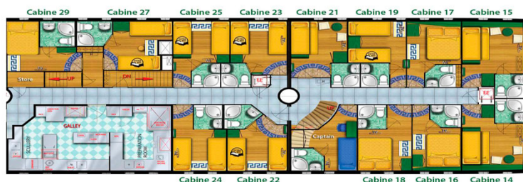
Main Deck Suite. From Tween Deck Cabin. From