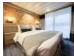
Studio Veranda Single