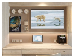
Category 5. From