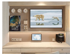
Category 4. From