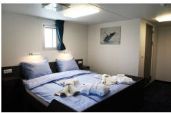
Triple Porthole Twin Deluxe